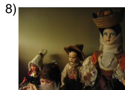
big doll, beautiful woman