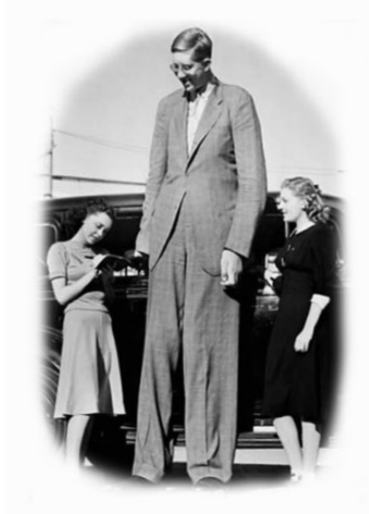
tall (masculine singular)