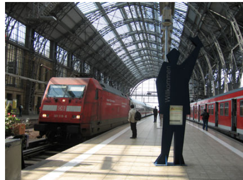
bus or train station