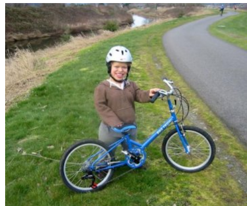
a short person