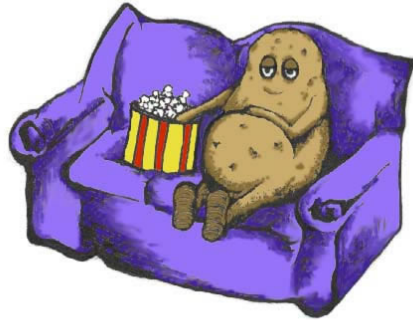
lazy, lazy person