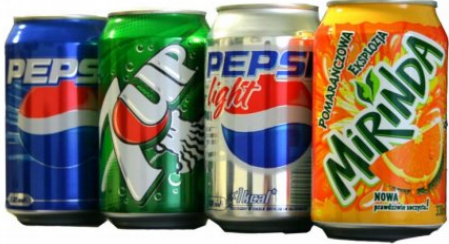
refreshments, soft drink