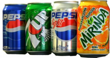
refreshments, soft drink