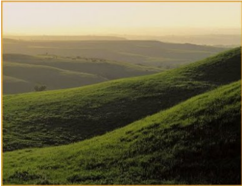
large hill, foot hills