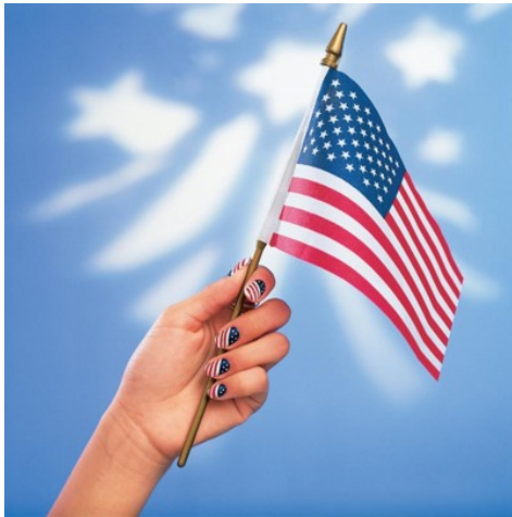
Fourth of July