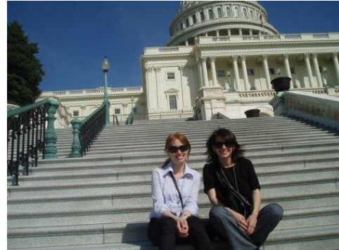
in front of