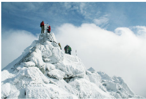
on top of