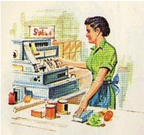
teller or cashier