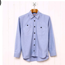
formal dress shirt