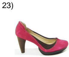
some short heeled shoes