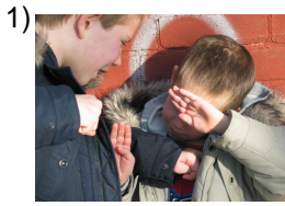
to bother, to bug

Order all the letters and fill in the blank with the corrected word.