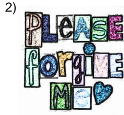
forgive me, excuse me