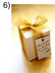
thank you very much