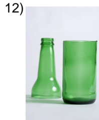
the bottle, jar