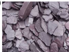
lead, slate, lead colour