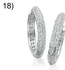
silver or money