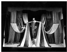
dress goods, fabrics